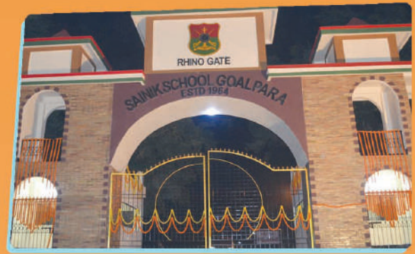
Sainik School, Goalpara