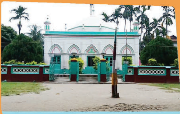
Pir Mazar Dargah, Jaleswar