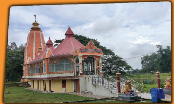
Historic Sri Sri Surja Pahar Mahapithasthan